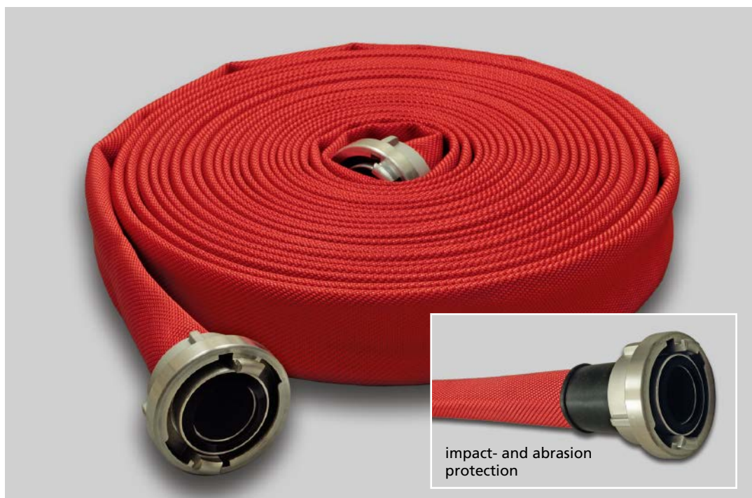
Syntex Color (red dyed)

Approvals or Certificates mailed to you on demand.